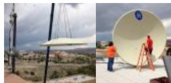
KGLP's new satellite dish up August 17, followed by pickup of the old dish by Sunrise School for solar applications.