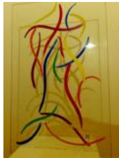
Torso No. 1 ↑