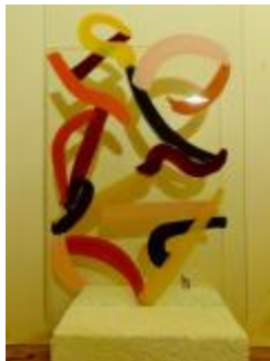
Fat Lines No. 2 ↑