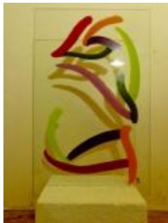
Fat Lines No. 3 ↑