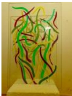
Torso No. 4 ↑