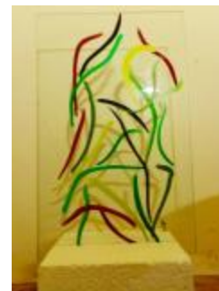
Torso No. 6 ↑