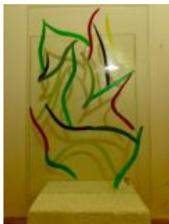
Torso No. 3 ↑