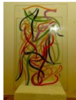
Torso No. 5 ↑