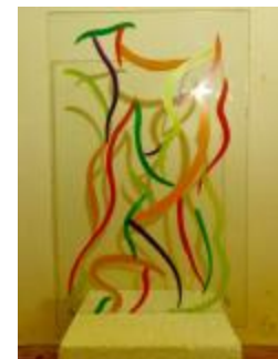
Torso No. 7 ↑

These pieces are designed to cast shadows on walls or other surfaces (outside, they might serve as a sundial of sorts!) Fingerprints can be removed with a damp cloth, though you should not clean the painted lines, especially with solvents! - you should specify which art you would like to reserve when making your pledge, for pickup by October 23rd (for general information, you may visit besargent.com ). For $250, you may choose from several Be Sargent landscapes, while they last. (Photos will be posted soon at KGLP.org ) $200 or more also gets a Day Sponsorship. You must request any of Be's art when pledging, donating, or soon after, since they may go fast!