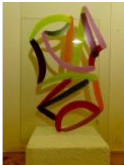
Fat Lines No. 1 ↑

$100 qualifies you to pick up one of Be Sargent's ten 10" x 16" indoor/outdoor tempered, beveled, weathered, recycled glass pane artworks, including recycled concrete bases. Seven of these pieces are abstract "torsos". Three are abstract "Fat Lines". Here are photos of these pieces: