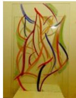
Torso No. 2 ↑