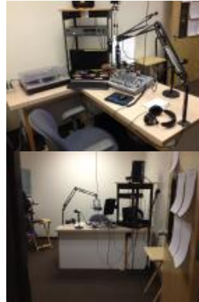
KGLP's New "Studio B", now used for recording. Eventually, we hope to fund a full-fledged on-air studio, interchangeable with "Studio A", our only current on-air studio.

"Studio B", is a simple recording room that has taken some of the pressure off of "Studio A", our on-air studio, giving staff extra work space, and allowing students in my UNMG course, "Performance for Radio and TV", to hit their marks with teleprompter and green screen