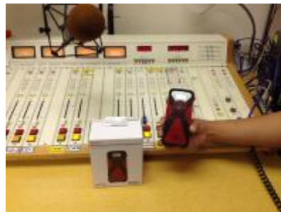
Left: Get one of these Eco-Powered radio flashlights with USB & hand-crank charging (charges phones, too): Details on page 6; On the Right, KGLP's art collection: Pick up one with a donation of $25-$250: